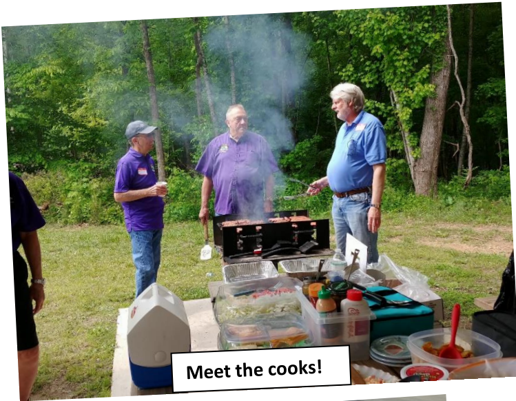
Meet the cooks!