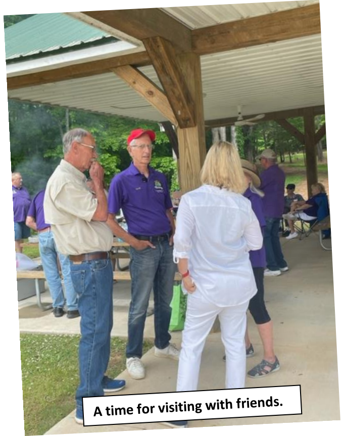
A time for visiting with friends.